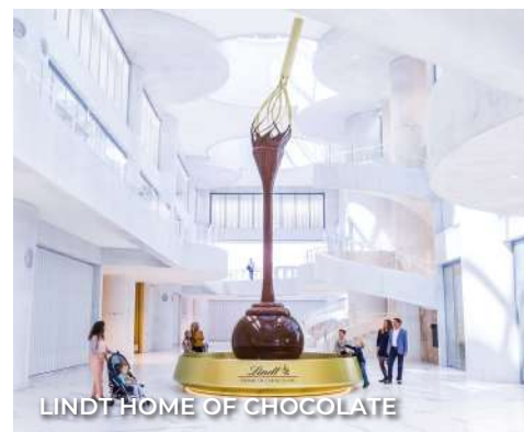
LINDT HOME OF CHOCOLATE

We hope you enjoyed your vacation with our company and we look forward to seeing you again for your next trip.