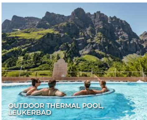
OUTDOOR THERMAL POOL, LEUKERBAD

Breakfast, Hotel Dinner Travel to Vevey , where you can pause for a photo at the Charlie Chaplin statue , followed by a captivating view of a giant fork emerging from Lake Geneva. Continue to Montreux , where you can capture the picturesque 13th-century Chillon Castle situated at the lake's eastern end. Proceed to Col Du Pillon and embark on a cable car ride to Glacier 3000 . Delight in the snowy fun park, experience the scenic Ice Express chairlift, and test your bravery on the Peak Walk by Tissot , the world's premier suspension bridge connecting peaks. This 108m long pathway offers breathtaking vistas of over 24 peaks towering above 4000m, featuring iconic landmarks such as the Jungfrau, Matterhorn, and Mont Blanc. Conclude your day with an exhilarating ride on the renowned Alpine Coaster , Europe's highest toboggan run.