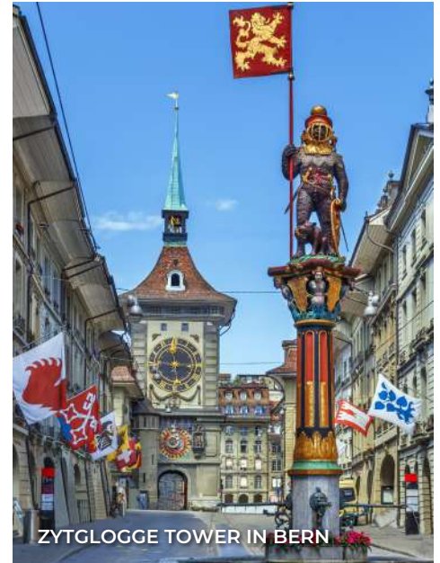
ZYTGLOGGE TOWER IN BERN

Breakfast Enjoy a free day exploring the scenic mountain surroundings or ops some various sports activities in Interlaken. Consider our optional trip to Jungfrauoch, the "Top of Europe," for awe-inspiring alpine views that promise an unforgettable experience. Optional: Jungfrauoch